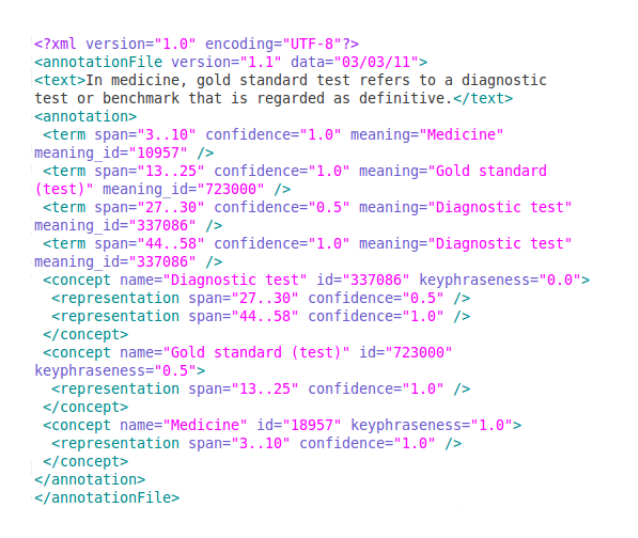
Figure 3: Example of downloaded XML test file.